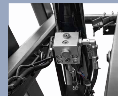
Explosion proof valve, To prevent the machine falling when the oil pipe is leaking