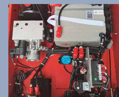
The parts are well located