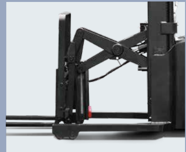
Forks move forward by the scissor structure