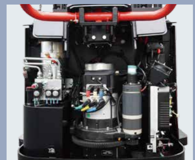
Back cover can be opened fully