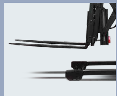
Proportional controlled forks can be operated more accurately